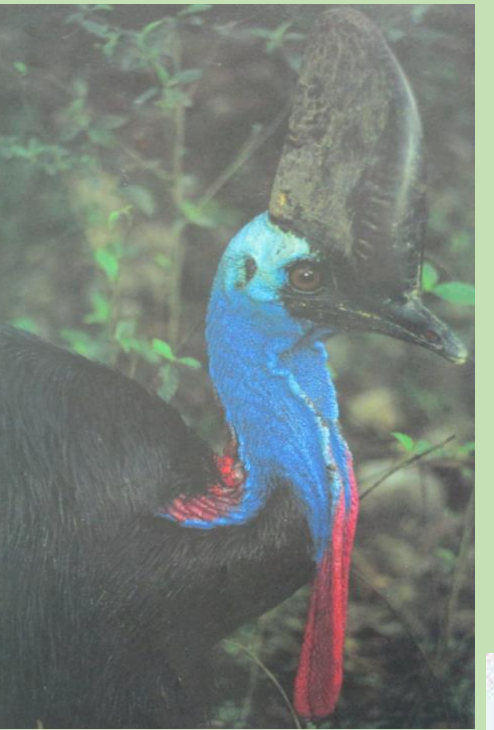
Southern Cassowary (Coates – 1985)