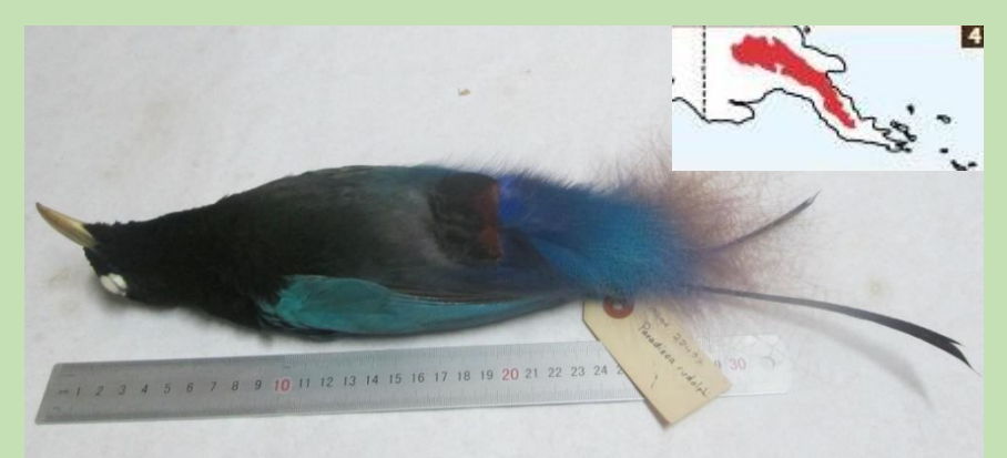
Blue Bird of Paradise